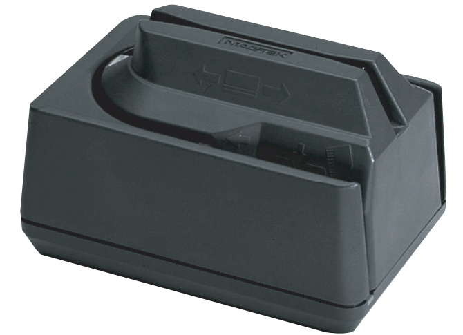
Mini MICR with MSR