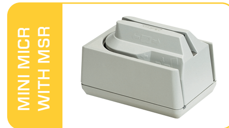
MINI MICR WITH MSR