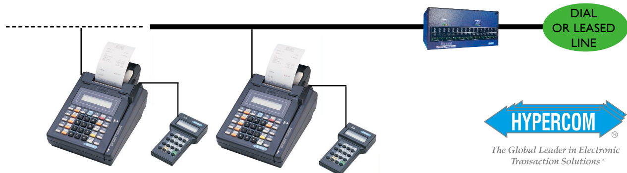
Stand-beside LAN terminal support