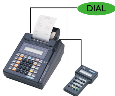
Stand-alone terminal support