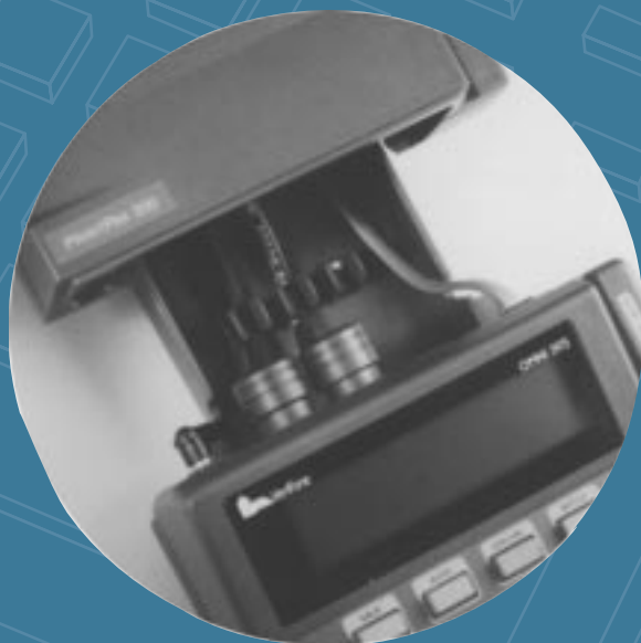
PRINTPAK 300 slides over the cables at the rear of the terminal.